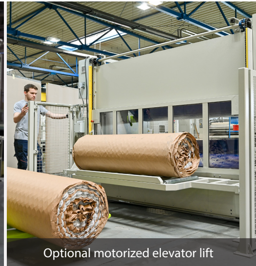
Optional motorized elevator lift